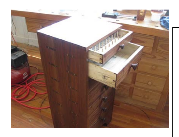
Walnut and spalted poplar sewing cabinet by Eddie Heerten