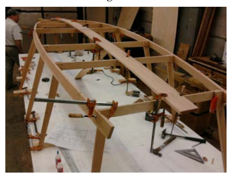
Could this be one of the entries to the show?

The annual show is the signature event for the Alabama Woodworkers Guild and we want everyone who can to participate. Good luck on your entry and we look forward to seeing you at registration.