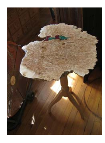
Mike Key's 3 legged table